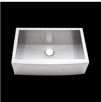
Single Bowl Straight Sink