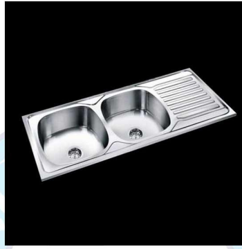
Double Bowl with Single Drain Board