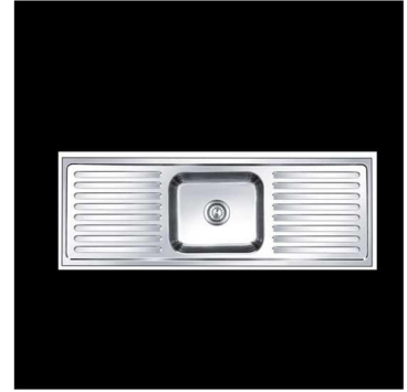
Single Bowl Sink with Double Drain Board