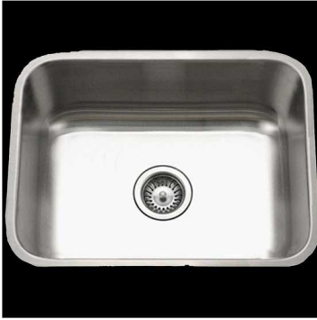
Single Bowl Sink