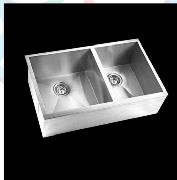
Double Bowl Straight Sink