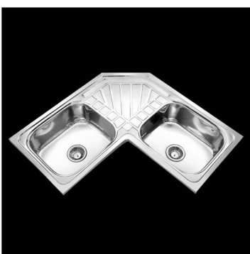
Double Bowl Corner Sink