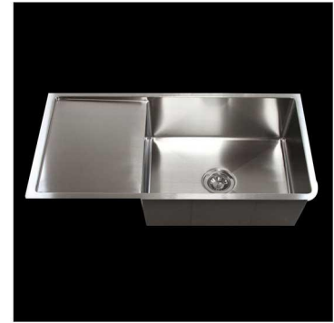
Single Bowl with Drain Straight Sink