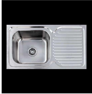
Single Bowl Sink with Single Drain Board